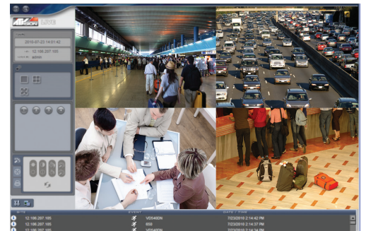
ATVision Pro® Remote Management Software