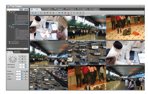
ATVision IP Remote Management Software