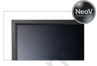
\mbox{NeoV}^{\mbox{\tiny out}} Optical Glass protects against scratches, impacts and other physical damage