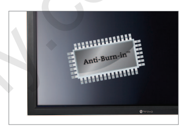
Anti-Burn-in ^{\mbox{\tiny technology}} technology prevents image sticking