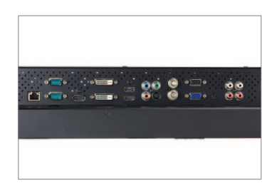
Multiple video inputs (VGA, DVI, HDMI, BNC, S-Video, DisplayPort and Component) allow for effortless system integration