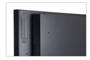
Durable metal casing for enhanced strength and secure mounting