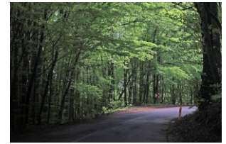
AG Neovo SC-Series