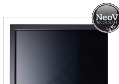
NeoV™ Touch Glass keeps the screen protected and looking new