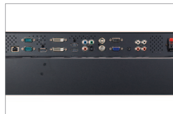
Multiple video inputs (VGA, DVI, HDMI, BNC, S-Video, DisplayPort and Component) allow for effortless system integration