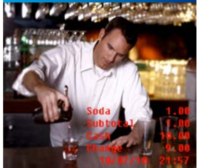
The picture above shows without doubt, that not all items passed over the counter were entered into the cash register