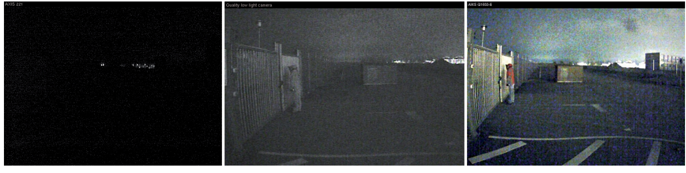
Lightfinder technology with AXIS 01602/-E, AXIS 01614/-E Network Cameras Left: Reference image, Middle: High-end surveillance camera, Right: AXIS 01602/-E Network Cameras

(-40 °F). Furthermore, they support IK10 rating for protection against impact and vandal acts. Additionally, AXIS Q1614/-E provides shock detection with adjustable sensitivity to send an alarm to personnel during attempted vandalism. Powered by Power over Ethernet makes installation easy since there is no need for a separate power cable.