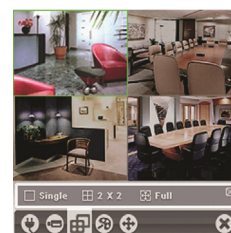
Advanced Remote RAS Plus and IPHONE App