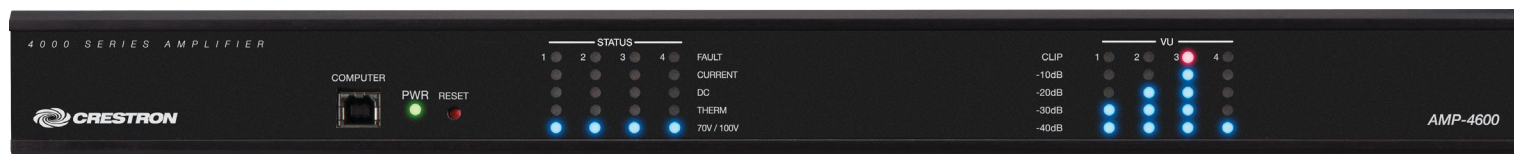
AMP-4600 – Front View