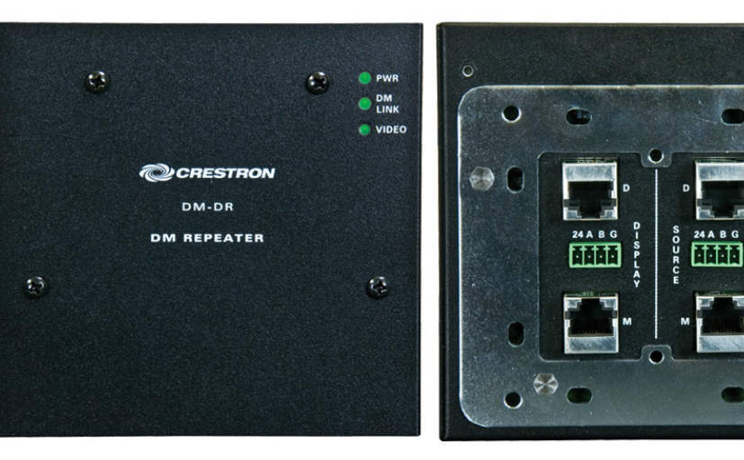
DM-DR – Front & Rear Views

SOURCE 24 A B G: (1) 4-pin 3.5mm detachable terminal block, DMNet port; Connects to DMNet port of a DM switcher, transmitter, or other DM device via DM-CBL cable<sup>[1]</sup>