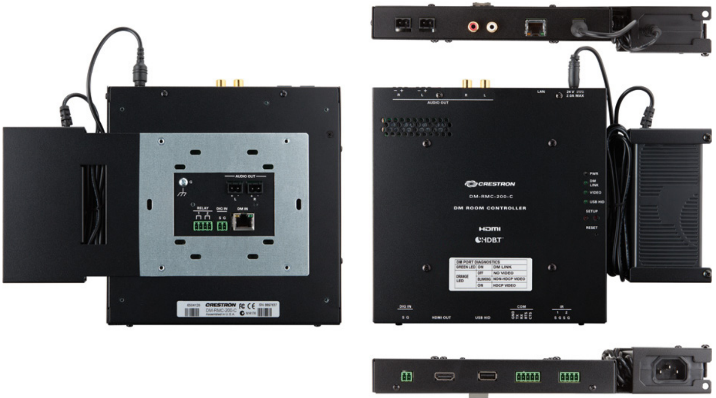
DM-RMC-200-C – Rear, Top, Front, and Bottom Views

and networking signals all through one simple RJ45 connection. [1] Multiple DM-RMC-200-Cs may be installed to handle each display in a multiroom distribution system, all fed from a central DM-MD series switcher. Or, a single DM-RMC-200-C can be fed straight from a DM 8G+ or HDBaseT transmitter, affording a simple solution for extending a computer or AV signal to a single display.