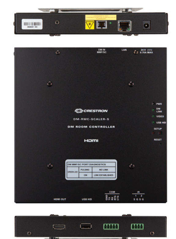
DM-RMC-SCALER-S – Rear, Top, Front, and Bottom Views