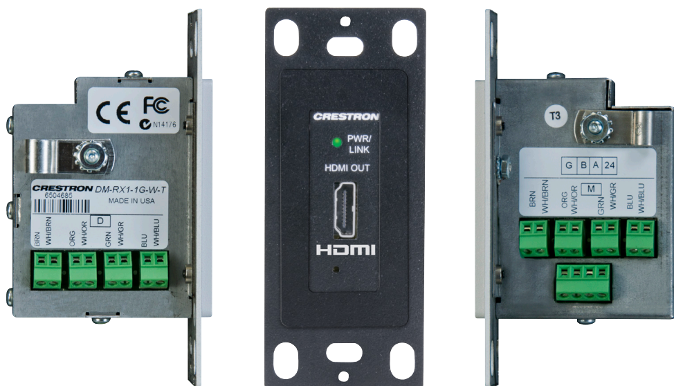
DM-RX1-1G – Left, Front, and Right Views