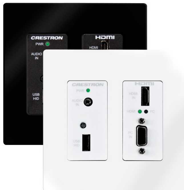
Faceplates not included.

The DM-TX-200-2G is a DM® CAT transmitter and switcher that installs in a double-gang electrical box to provide a convenient interface for computers and high-definition AV sources as part of a complete Crestron® DigitalMedia™ system. The DM-TX-200-2G is ideal for wall, lectern, and floor box applications in a boardroom, classroom, auditorium, or residence. It connects to the head end or display location using a single Crestron DM cable, providing HDMI®, VGA, and analog audio inputs, plus a USB HID host port. Standard gang-box mounting allows for installation adjacent to an Ethernet jack (Crestron MP-WP183 or equivalent) for a total connectivity solution [1] .