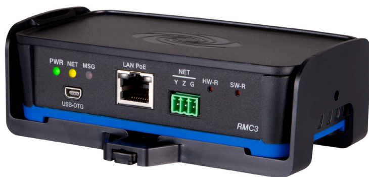
Shown with mounting bracket