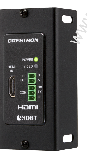
DM-TX-4KZ-100-C-1G-B-T with Included Faceplate