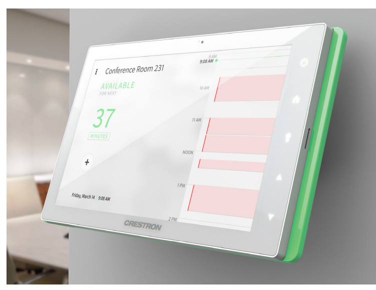
Shown in Room Scheduling mode with optional Light Bar and Multi-Surface Mount Kit

room for any available time slot. If that room isn't available when you want it, the touch screen can find you another available room nearby. Additional optional functions include the abilities to check into a scheduled meeting extend a meeting, end a meeting early, toggle between two languages, or limit access to various functions using PIN code authorization.