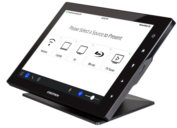
TSW-1060-NC-B-S with TSW-1060-TTK-B-S Tabletop Kit

High-performance streaming video capability makes it possible to view security cameras and other video sources right on the touch screen.