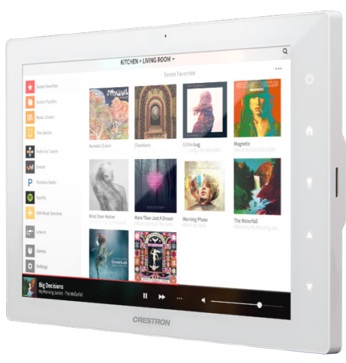
TSW-1060-NC-W-S - Shown in White

Crestron Smart Graphics offers these enhancements and more: