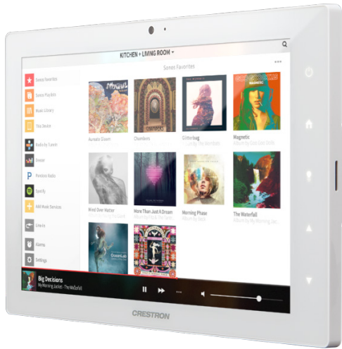
TSW-1060-W-S – Shown in White