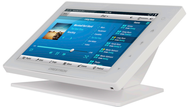
TSW-750-W-S with TSW-750-TTK TableTop Mounting Kit