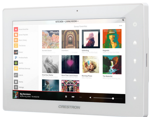
TSW-760-NC-W-S – Shown in White