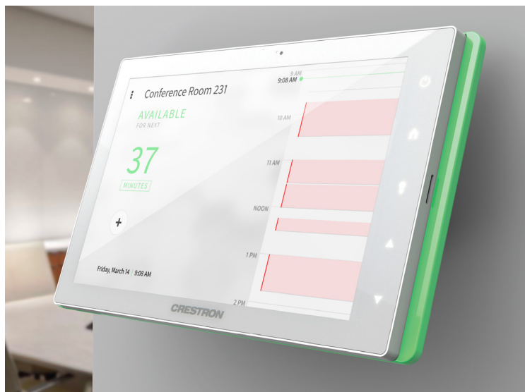
Shown in Room Scheduling mode with optional Light Bar and Multi-Surface Mount Kit

optional functions include the abilities to check into a scheduled meeting, extend a meeting, end a meeting early, toggle between two languages, or limit access to various functions using PIN code authorization.