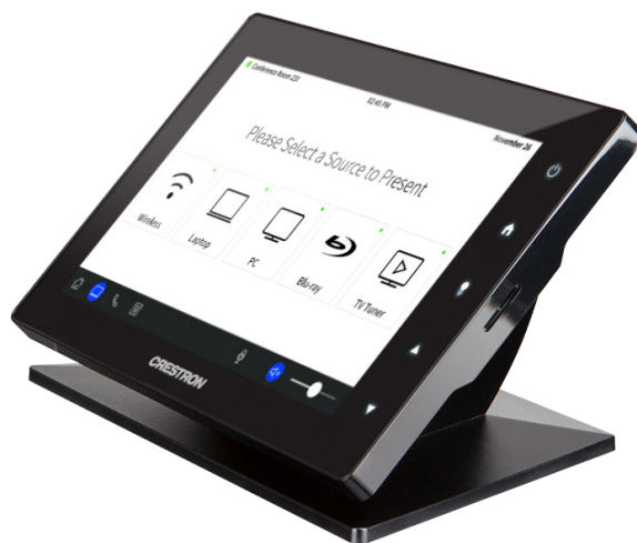
TSW-760-NC-B-S with TSW-760-TTK-B-S Tabletop Kit

Crestron Smart Graphics offers these enhancements and more: