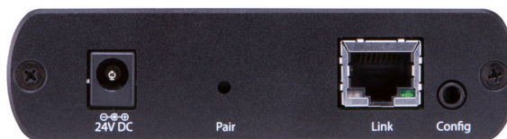
USB-EXT-DM-REMOTE – Rear View