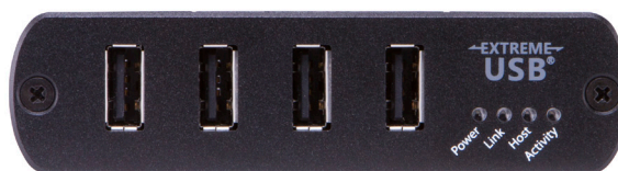
USB-EXT-DM-REMOTE – Front View