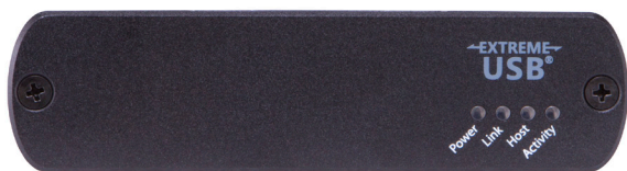
USB-EXT-DM-LOCAL – Front View