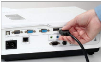
Connect and project.