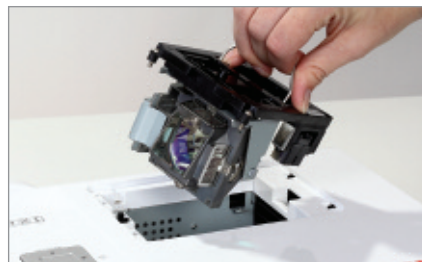
Easy to change long-life lamp.