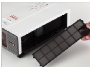
Handy access to air filter.