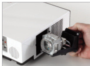
Easy to change long-life lamp.