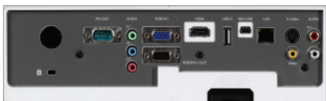
Includes a full complement of connections, including network control.

EIKI® is a registered trademark of Eiki International, Inc. Kensington® is a registered trademark of ACCO Brands Corporation.