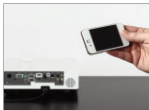
Wireless access with mobile terminal.