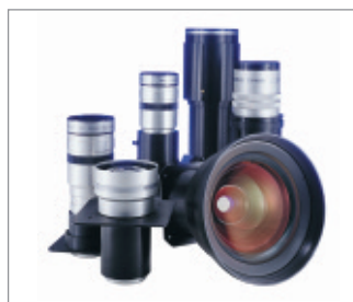
Broad selection of lenses.