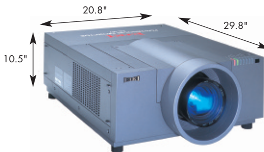
LC-X800A - XGA • 3LCD+One imaging engine.