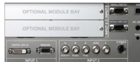
Ready to connect and project. Add Network, SDI, and more!