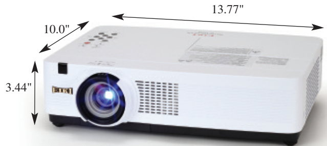
LC-XB250A • XGA projector