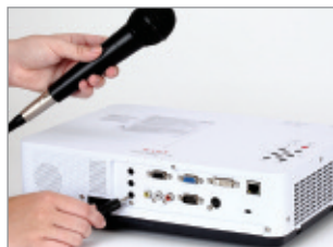
Built-in 10 Watt sound system.