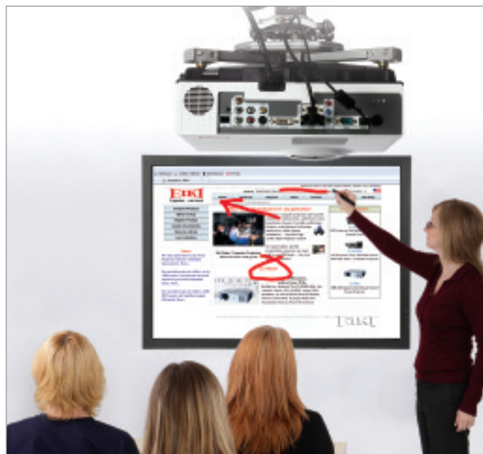
Simple and user-friendly interactive function makes it easy for you to handwrite and draw anything on screen.