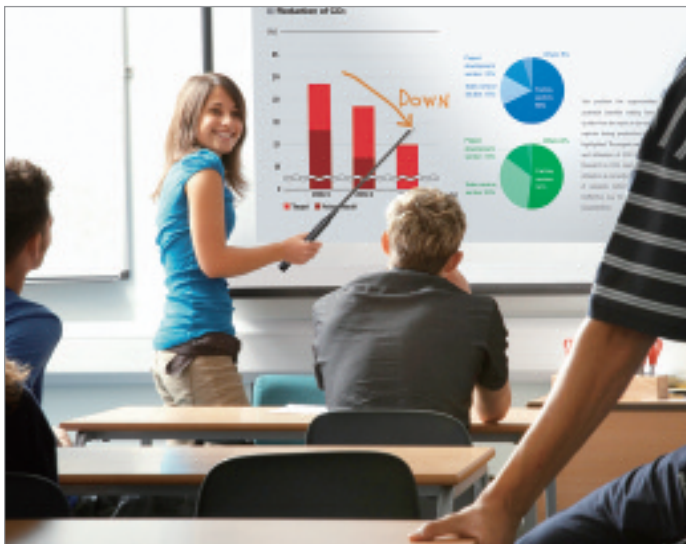
Interactive function permits real-time annotation on projected image. Pen and Pointer function as both writing instruments and computer mouse.