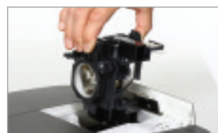
Easy lamp change.