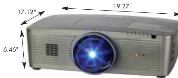
LC-XL100A - XGA • 3LCD "Conference" Projector.