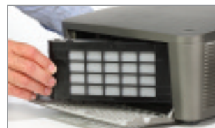
Replaceable air filter cartridge.