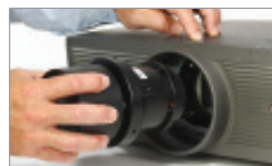
Quick lens change.