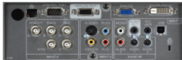
Here's everything you need to connect and project.