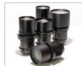
Range of wide-angle and telephoto lenses.