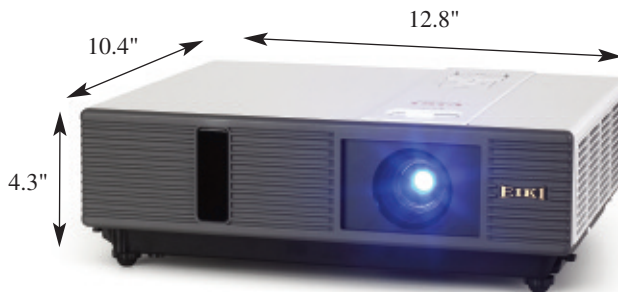
LC-WNB3000N, LC-XNB3500N, LC-XNB4000N • XGA projector.