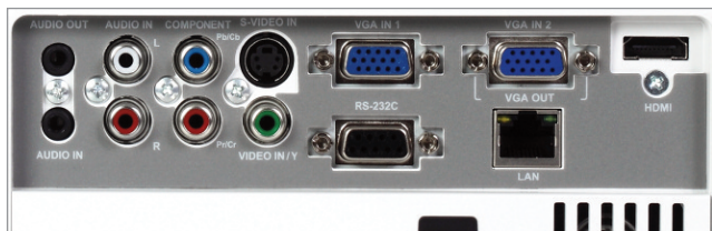
Includes a full complement of connections, including network control.

EIKI® is a registered trademark of EIKI International, Inc. Kensington® is a registered trademark of ACCO Brands Corporation.