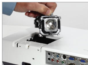
Easy to change long-life lamp.