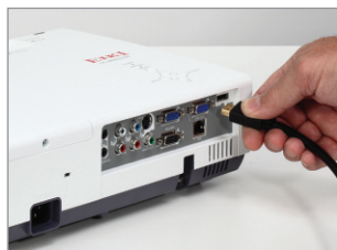
Just project and connect.