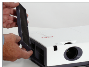
Handy access to air filter.