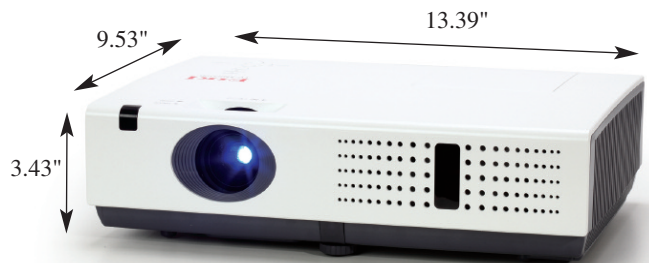
LC-XNS2600 / LC-XNS3100 • XGA projectors.