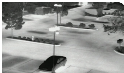
The most accurate intrusion detection and video alarm verification system available.