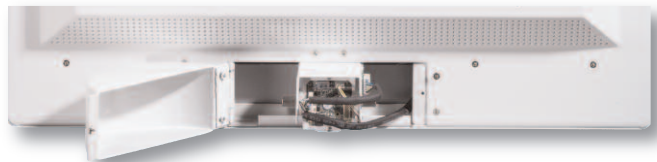
Camera Compartment (Door Open)