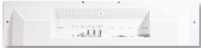
Input Panel (Cover Removed)