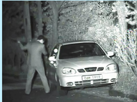
Car Theft with IR Illumination