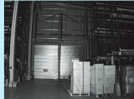
Warehouse with IR Illumination