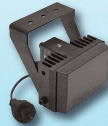
PoE model also available