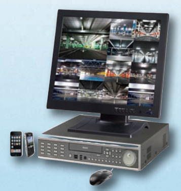
ZM-L Series now includes HDMI input to maximize resolution with DIGIMASTER H.264 DVRs.