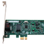
EPCI-NIC EPCI-NIC Pre-Installed Additional Network Card