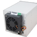
L-NSAARRK L-NSAARRK 2nd SATA Back Box