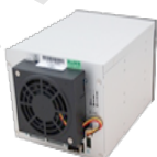
L-NSARK-PI L-NSARK-PI Pre- Installed SATA Box