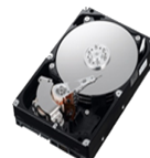
1TB-UG 1TB-UG Additional 1 x 1 TB Hard Drive -Total 2TB