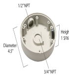
Ax61BB Ax61BB Back Box Mounting Base