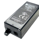
PSA16U-480 PSA16U-480 Single Channel PoE Injector