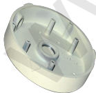
Ax52BB Ax52BB Camera Backbox