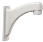
i3D703 i3D703 Simple Wall Mount Bracket