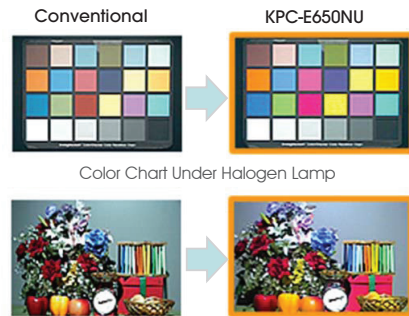
Color Chart Under Halogen Lamp

KPC-E650NU is equipped with more excellent color reproduction from wide range of ATW. (1,800K to 10,500K)