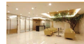
16:9 HD 1920 x 1080

HD camera delivers a megapixel quality video without requiring IT network bandwidth, dropping packets, or reduced resolution from compression.