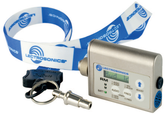
The RM is supplied with a quick-release lanyard

Input gain is adjusted by setting the desired value on the LCD on the RM in the same manner as it is adjusted on the transmitter. A single pushbutton press and a brief tone burst then transfers the setting to the transmtter. Frequency is adjusted in the same manner, with the options of setting it directly by hex switch code or adjusting it by block and frequency in MHz.