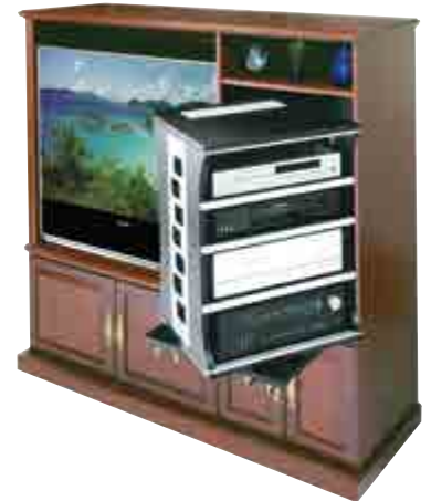
ASR-HD shown fully extended and rotated