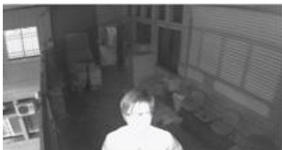
Adaptive IR OFF