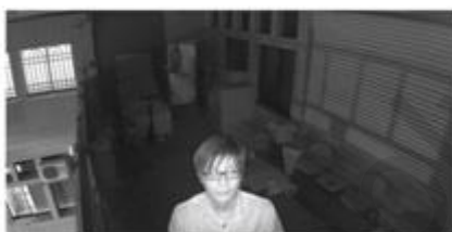
Adaptive IR ON