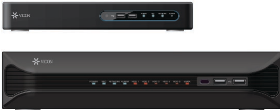
8 and 16 Channel Models