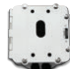
PB24 Rugged cast aluminum power box with 84vA and 24W power supply