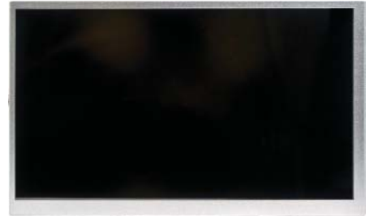
PCB Mechanical Dimension(m/m)