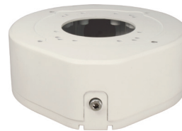
VT-TJB04 Optional Junction Box for Cable Management for use with VTC-T4T3HR2MD & VTC-T4B4HR2MD