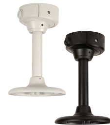
VT-AV/CMT Outdoor Heavy Duty ALPHA Series Ceiling Mount