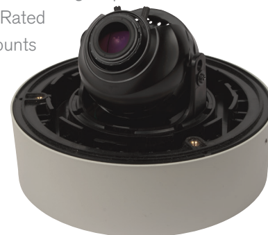
Alpha Dome Inside