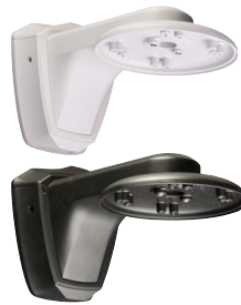
VT-AV/WMT Outdoor Heavy Duty ALPHA Series Wall Mount