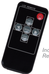
Included IR Remote Control